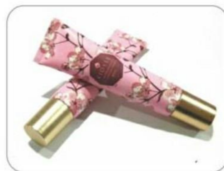
软管样品 Tube Sample