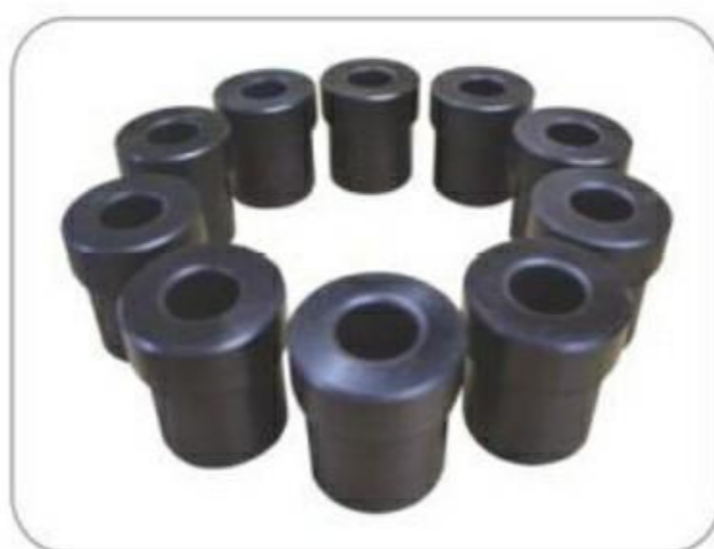
本机杯座（根据软管尺寸定做） Tube holder (Custom made according to tube' s size)